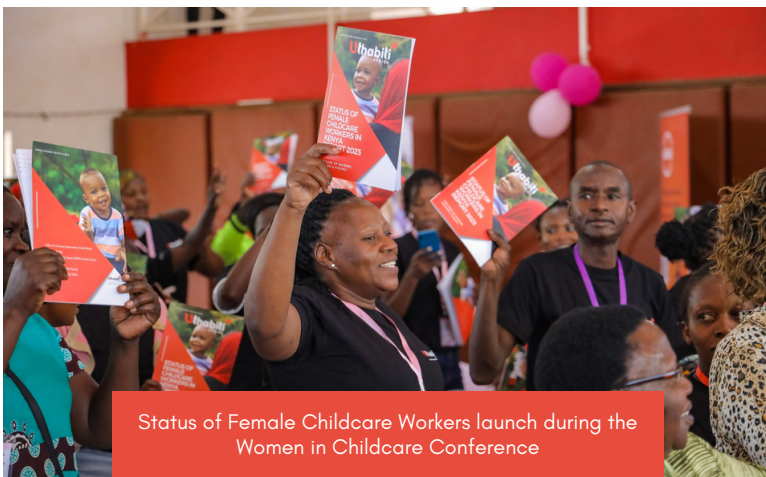
Status of Female Childcare Workers launch during the Women in Childcare Conference

In June 2023, the Women in Childcare (WiC) Technical Working Group (TWG), hosted by CAC, convened a virtual meeting. The meeting was a follow-up to the Women in Childcare Conference held on March 6th and 7th at ABSA Sports Club.