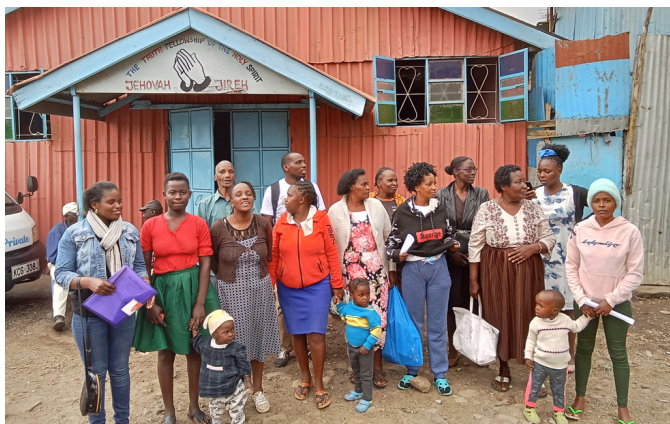
(Women In Childcare Network - Mathare)

Our Women in Childcare network has greatly grown this year. We have more women joining the Collaborative SACCO which empowers them financially and enabling them to grow their day care businesses.